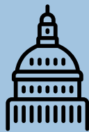
CARES ACT, ESSER, ARP Funding

Explore funding avenues, including federal, state, and private grants, aligned with Cognition's goals.