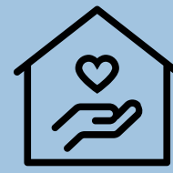
Private and Non-Profit Funding