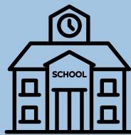
Title I, Title II, and Title IV Funding